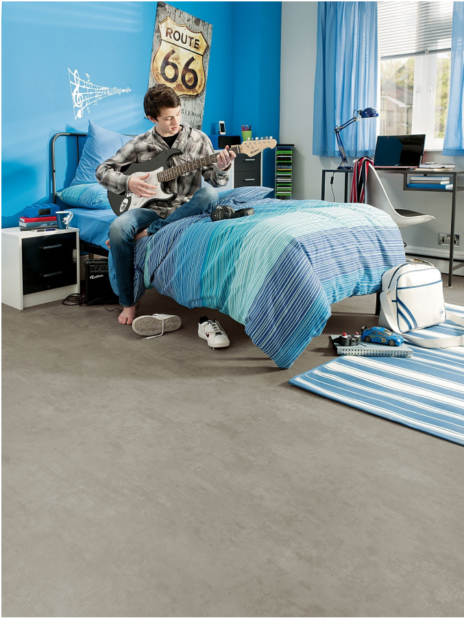
Example of a use area - Polyflor Secura PUR