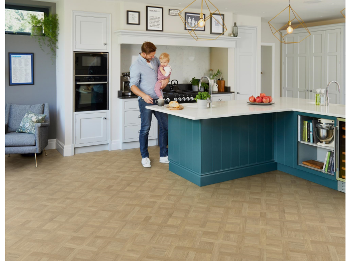
Example of a use area - Polyflor Architex PUR