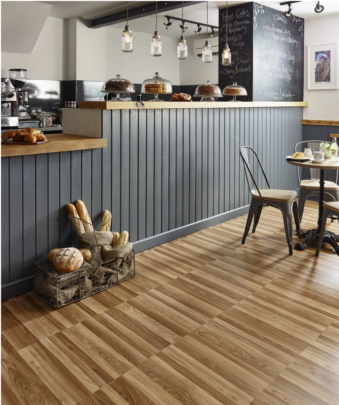
Example of a use area - Polyflor Designatex PUR

Polyflor Designatex PUR is use classified at 23 and 31, Polyflor Architex PUR is use classified at 23 and 32 and Polyflor Secura PUR is use classified at 23, 32, 41 according to ISO 10874.