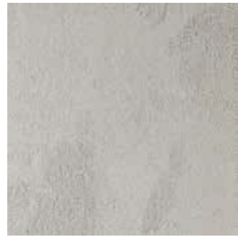
65741 LRV 44,38