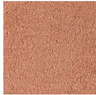
66638 LRV 24,61