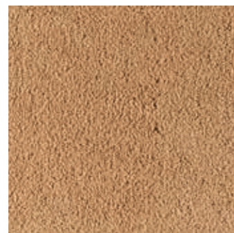
66633 LRV 20,79