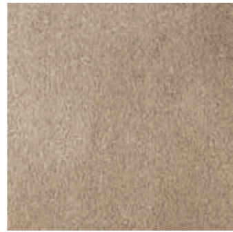
65730 LRV 26,06