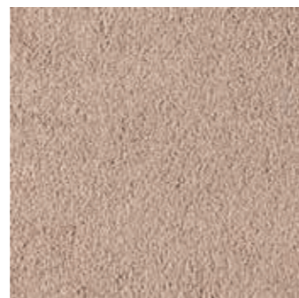
66620 LRV 29,05