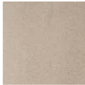
65720 LRV 32,33