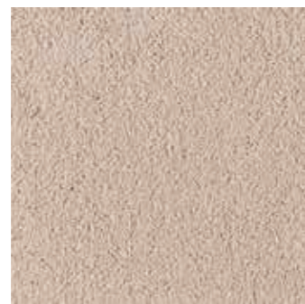
66611 LRV 42,65