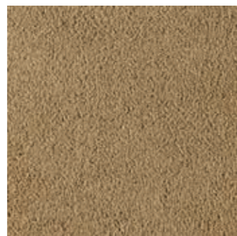
66671 LRV 20,60