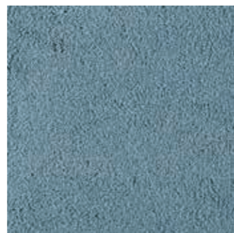
66665 LRV 17,35