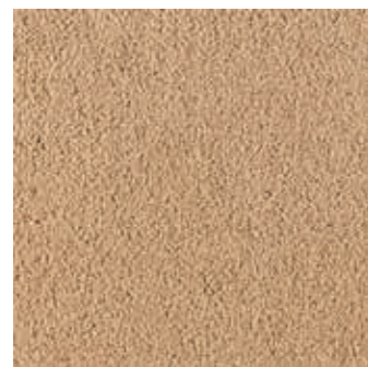
66639 LRV 30,49