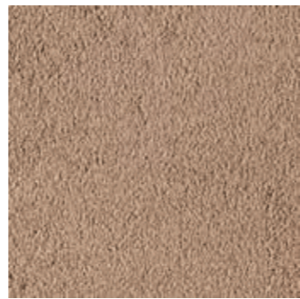
66631 LRV 23,04