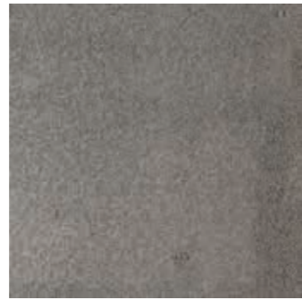
65743 LRV 17,54