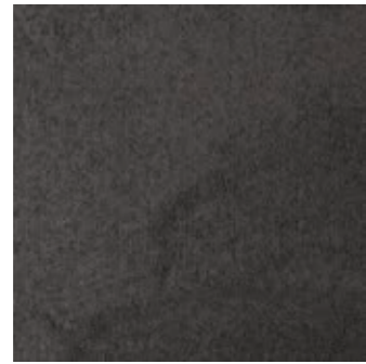
65745 LRV 7,21