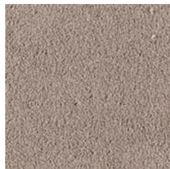
66641 LRV 24,78