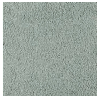
66663 LRV 25,21